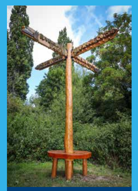
The new signpost at the main entrance to Marlhill Copse