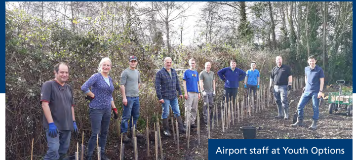
Airport staff at Youth Options

If you have any questions, or would like any further information, please do not hesitate to contact us via soufeedback@southamptonairport.com