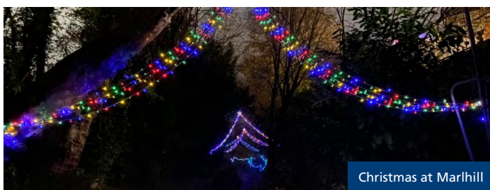
Christmas at Marhill