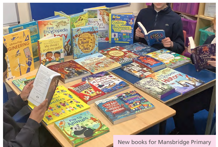
New books for Mansbridge Primary

If you would like more information on Southampton Airport's work in the local community, or would like to ask any questions, please contact our communications team via soufeedback@southamptonairport.com