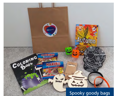
Spooky goody bags