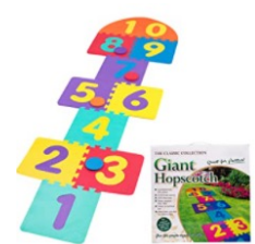
New play equipment at Townhill Infant School